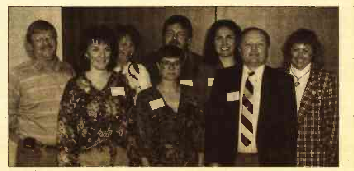
Local 378's education committee, which organized the conference, pose for this photo opportunity.