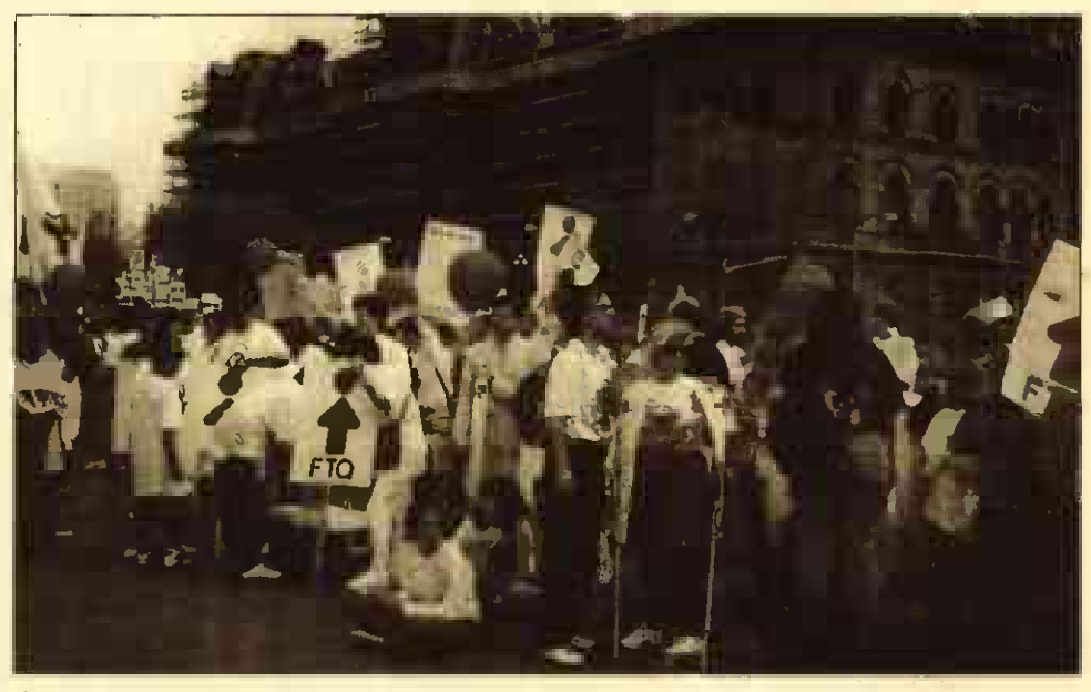
Quebec locals line up.